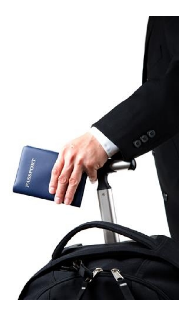
Tips & Warnings

Remember to ask about deposit policies. Holds on your credit card can add up. Many hotels place a small hold on your charge card for incidentals, while some do not if you specify that you won't, for example, use the mini bar. Just ask.